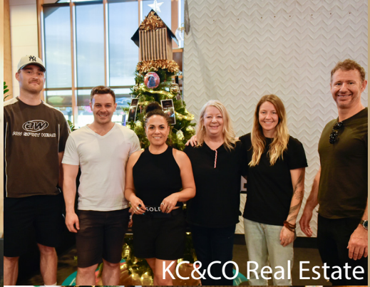
KC&CO Real Estate