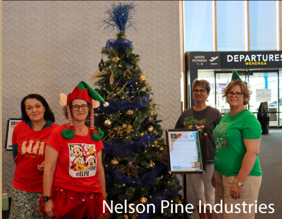
Nelson Pine Industries