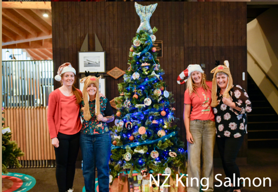
NZ King Salmon