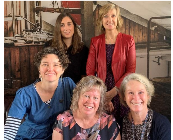
Nelson Tasman Hospice Education Team

Atawhaitia, Manaakitia Mō Ake Tonu ~ To Care Always