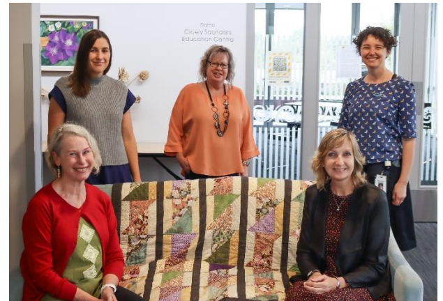
Nelson Tasman Hospice Education Team L – R